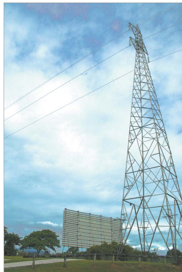
The former drive-in site at Woree.