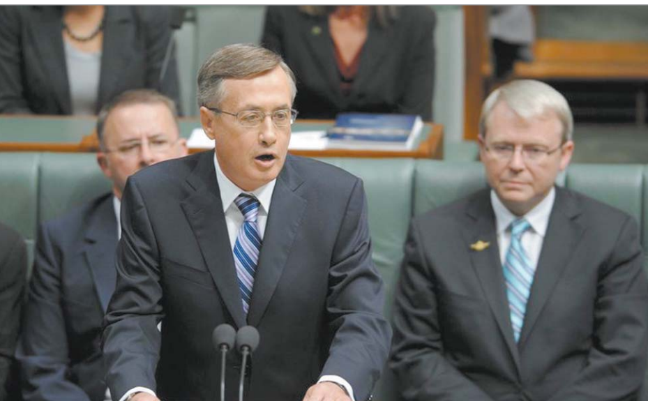
The Federal Treasurer, Wayne Swan delivers his first budget

He has limited access to some government benefits for families on incomes of more than $150,000.